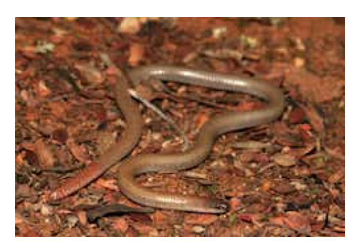
The pink-tailed worm lizard is one of the rare species living in the native grasslands of the Southern Tablelands.

However, most native grasslands have not just been modified by grazing but completely replaced by man-made pastures. That is, the land has been ploughed, fertilised and the seeds of introduced grasses have been planted. These changes to the landscape mean much of the landscape is dominated by introduced plants and is now unsuitable for many of the native plants and animals that once lived and grew there.