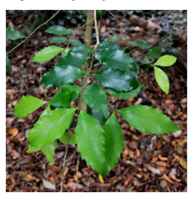
Daphnandra johnsonii

A member of the ancient Gondwana family Atherospermataceae, the Illawarra socketwood is endangered by extinction. Formerly considered the southernmost population of Daphnandra micrantha , the Australian socketwood. Recently it has been recognised as a separate species.