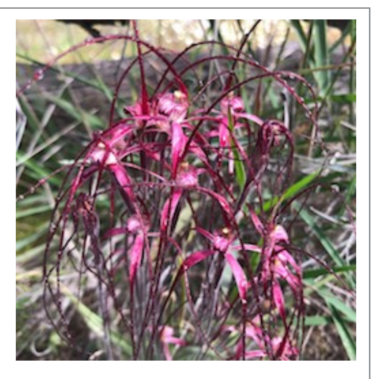
Blood Spider Orchid (Caladenia filifera)

These orchids can only grow in extremely specific conditions. Even if they're planted somewhere else, they will still die. It is illegal to pick wildflowers without a permit. The Shire says they've reported the incident to the Department of Biodiversity, Conservation and Attractions.